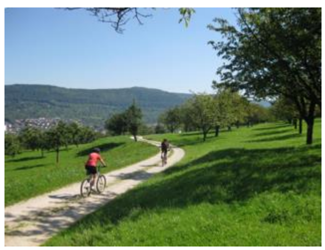
Day 4: Murnau am Staffelsee - Füssen/ Schwangau 60 kms

Cycle in Central Europe's largest moorland area to the splendid city of Füssen, surrounded by magnificent alpine peaks and blue-green mountain lakes. See the outline of the 2,000 year old Roman road, Via Claudia, in the city's pedestrian zone. Your hotel is located close to King Ludwig's fairy-tale castle so you can easily bike there to visit if you have time in the afternoon. Shy King Ludwig built the castle in the 19th century to withdraw from public life – nowadays vast numbers of people come to visit his once private refuge in its idyllic setting.