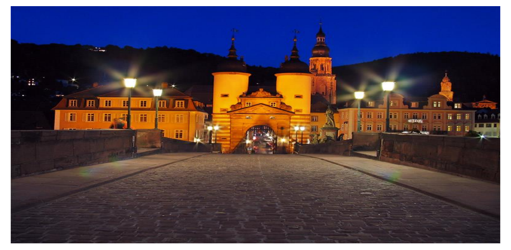
old town (optional excursion payable and booked on board).

Cruise along the Rhine past Worms to Mannheim. Start your cycle tour to the Celtic city of Ladenburg before reaching the "Student Prince' town of Heidelberg. This old city, overlooked by a stunning castle, attracts tourists from all over the world. Join your tour leader for an optional city walk of Heidelberg (book and pay onboard).