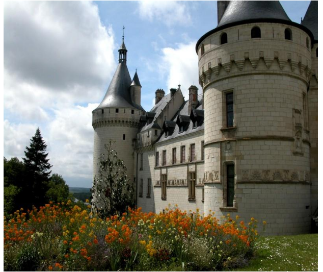
Chateau de Chaumont-sur-Loire

Today cycle through the countryside and delightful villages to Chaumont-sur-Loire. Visit the 15 th century chateau which proudly dominates the town and the river. Its wonderful garden hosts a Garden Festival from late May to October each year, where amazing and creative interpretations of a common theme attract visitors from all over the world.