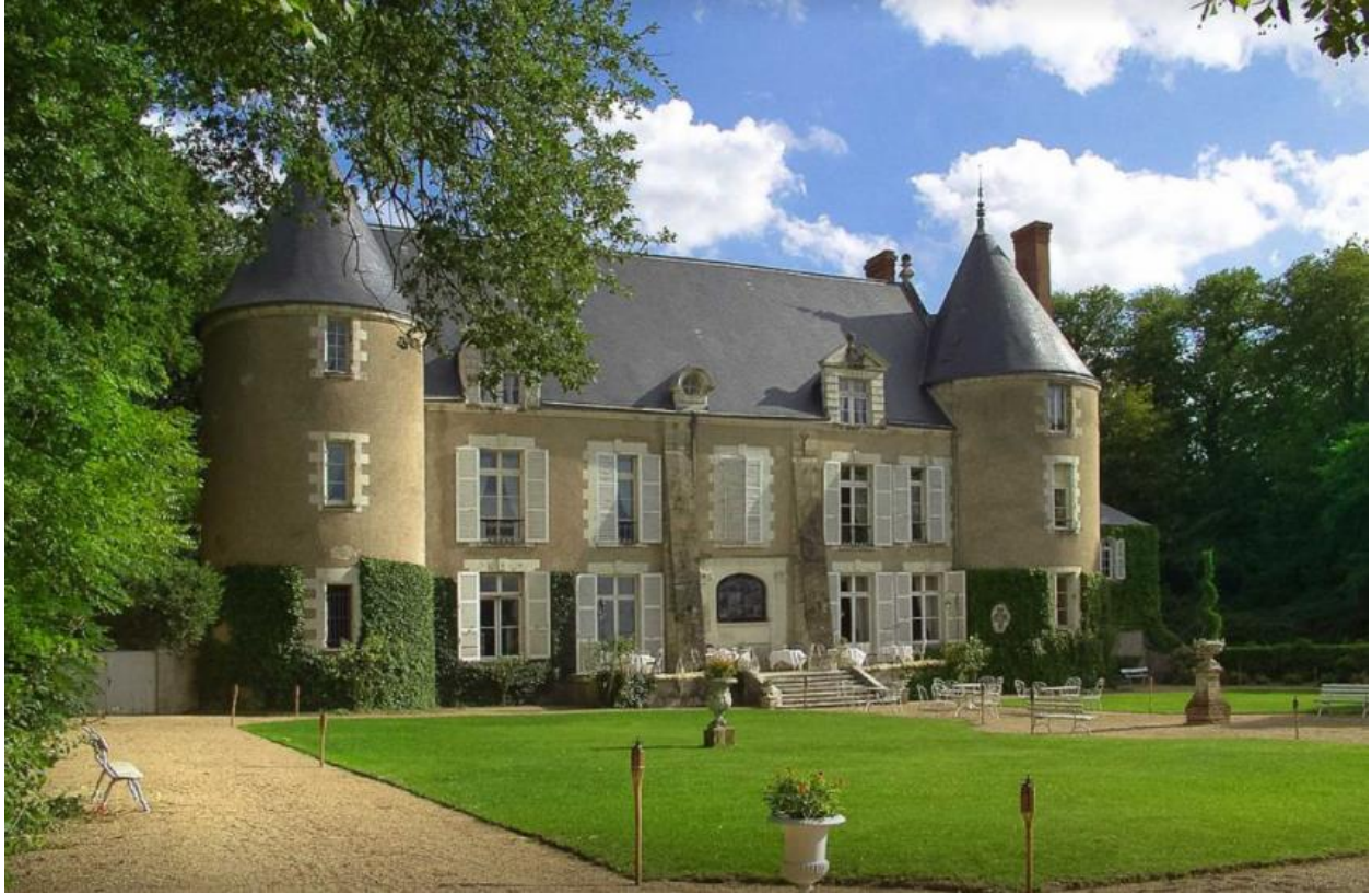
Chateau de Pray