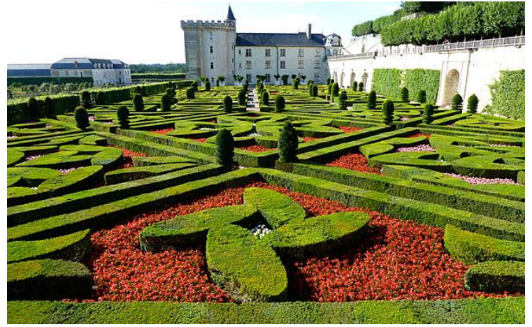
Gardens of Villandry