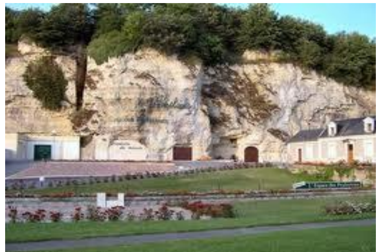
Caves and cellars along the Montlouis vineyards