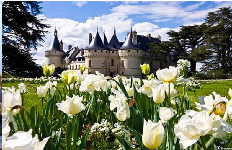
Chateau de Chaumont 'Garden Festival'