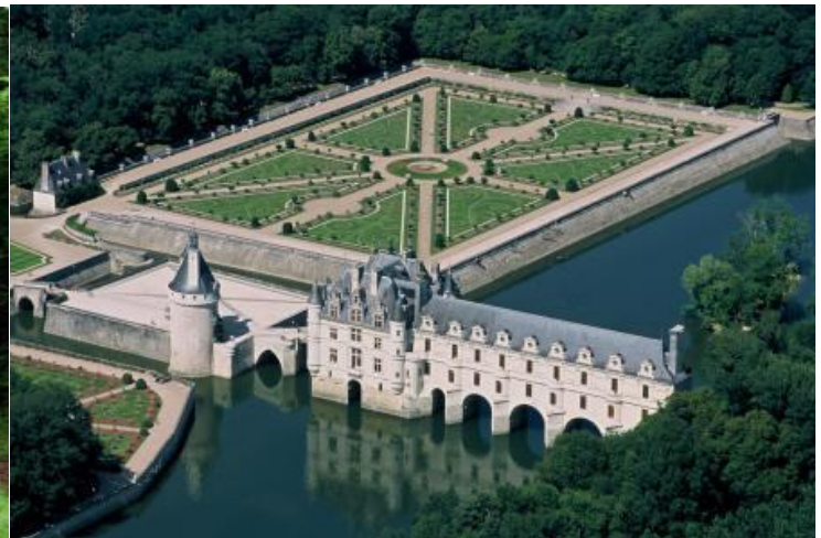
Chateau de Chenonceau