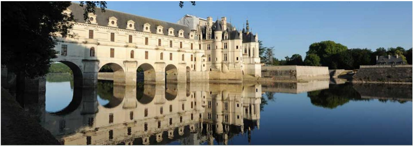
Château de Chenonceau