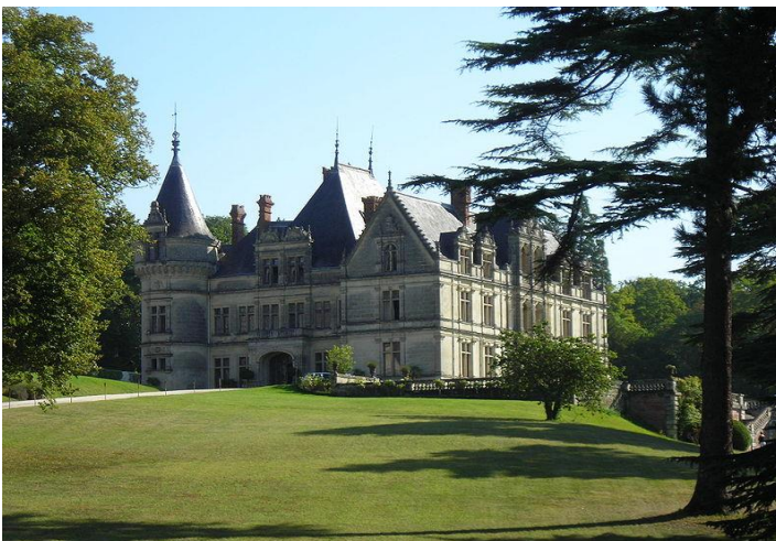
Chateau de la Bourdaisière