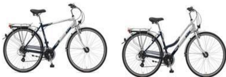
21 speed bikes

Passau parking: garage €79/ space €68 (incl. transfer to/from ship, payable on-site)