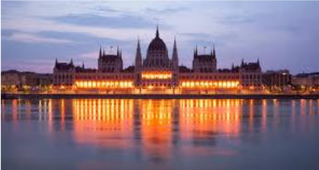
Parliament Buildings, Budapest